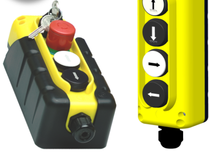
MOBILE-PENDANT FIXING (with WALL BRACKET accessories) WALL FIXING